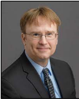
Deputy Attorney General