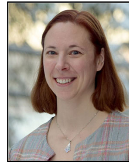
Deputy Attorney General