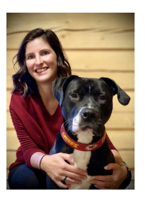
Thank you! Questions?