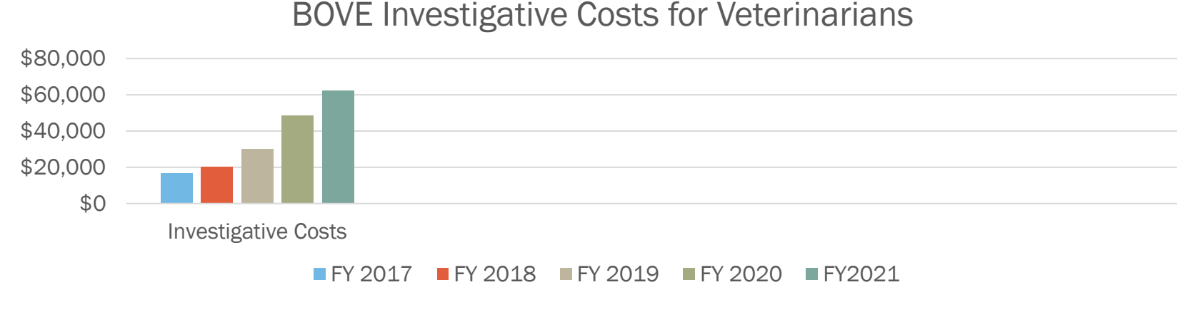
Costly and onerous requirements for monitoring veterinarians have been placed on the board of veterinary examiners (BOVE).

Alaska veterinarians have the highest licensing fee in the country.