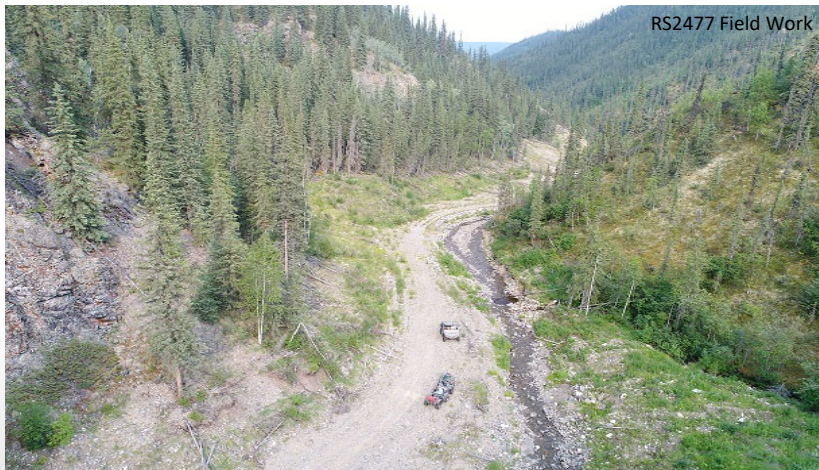
RS2477 Field Work