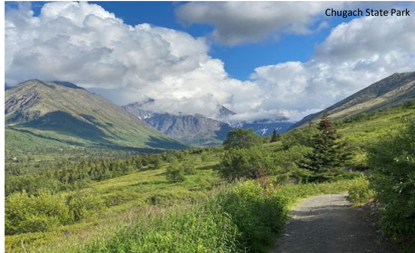
Chugach State Park