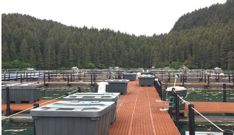
Hatchery Net Pens