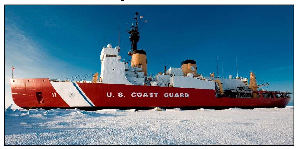
Figure A-2. Polar Sea