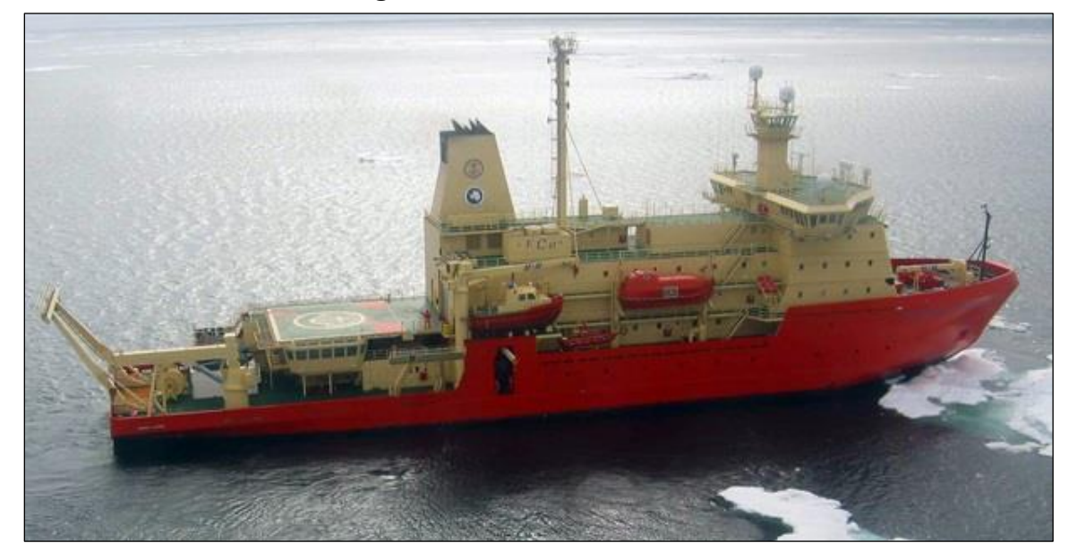
Figure A-4. Nathaniel B. Palmer

Nathaniel B. Palmer ( Figure A-4 ) was built for the NSF in 1992 by North American Shipbuilding, of Larose, LA.