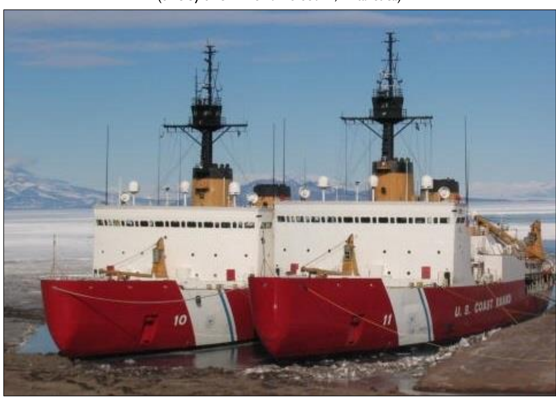
Figure A-I. Polar Star and Polar Sea (Side by side in McMurdo Sound, Antarctica)

Polar Star (WAGB-10) and Polar Sea (WAGB-11),<sup>40</sup> sister ships built to the same general design ( Figure A-1 and Figure A-2 ), were acquired in the early 1970s as replacements for earlier U.S. icebreakers. They were designed for 30-year service lives, and were built by Lockheed Shipbuilding of Seattle, WA, a division of Lockheed that also built ships for the U.S. Navy, but which exited the shipbuilding business in the late 1980s.