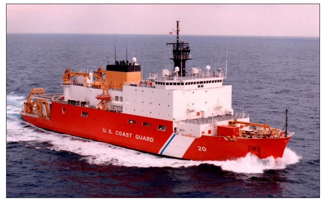
Figure A-3. Healy

Healy (WAGB-20) ( Figure A-3 ) was funded in the early 1990s as a complement to Polar Star and Polar Sea , and was commissioned into service on August 21, 2000.