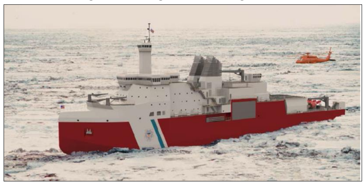
Figure 3. Rendering of VT Halter Design for PSC

somewhat smaller concept design for Polarstern II might have a displacement (including payload) of something less than 26,000 tons, and perhaps closer to 23,000 tons.