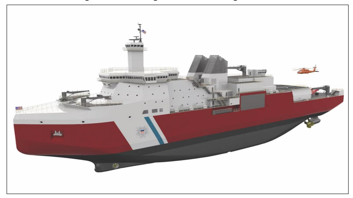
Figure 1. Rendering of VT Halter Design for PSC

In addition to TAI, VT Halter Marine has teamed with ABB/Trident Marine for its Azipod propulsion system, <sup>18</sup> Raytheon for command and control systems integration, Caterpillar for the main engines, Jamestown Metal Marine for joiner package, and Bronswerk for the HVAC system. The program is scheduled to bring an additional 900 skilled craftsman and staff to the Mississippi-based shipyard. <sup>19</sup>