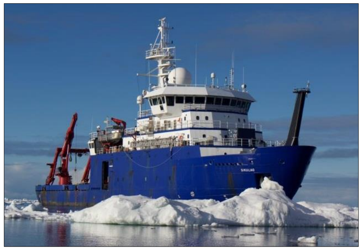
Figure A-6. Sikuliag

Sikuliaq (see-KOO-lee-auk; Figure A-6 ), which is used for scientific research in polar areas, was built by Marinette Marine of Marinette, WI, and entered service in 2015. It is operated for NSF by the College of Fisheries and Ocean Sciences at the University of Alaska Fairbanks as part of the U.S. academic research fleet through the University National Oceanographic Laboratory System (UNOLS). Sikuliaq is 261 feet long and has a displacement of about 3,600 tons. It has a crew of 22 and can embark an additional 26 scientists and students. The ship can break ice 2½ or 3 feet thick at speeds of 2 knots. The ship is considered less an icebreaker than an ice-capable research ship.