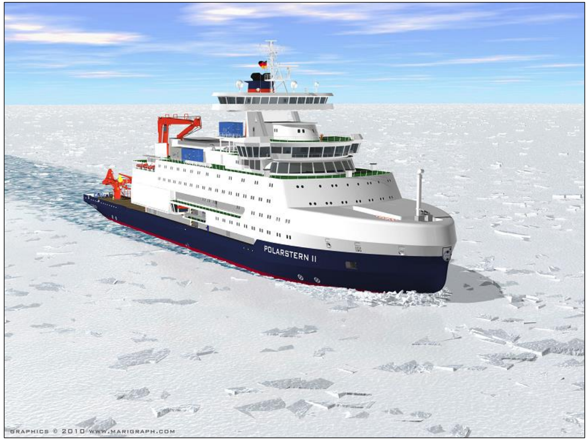
Figure 4. Rendering of SDC Concept Design for Polarstern II

"With the propulsors, with one fixed and two steerable, we were able to optimize the seakeeping capability so when you're going on long transits from Washington to Antarctica the crew is not beat to a pulp or heavily fatigued because of the stability characteristics in open water." <sup>27</sup>