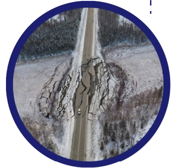
DISASTER RESILIENCY & RESPONSE