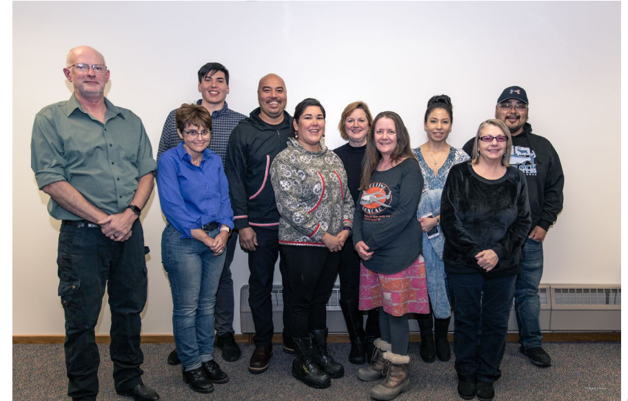
2019 Path to Prosperity finalists