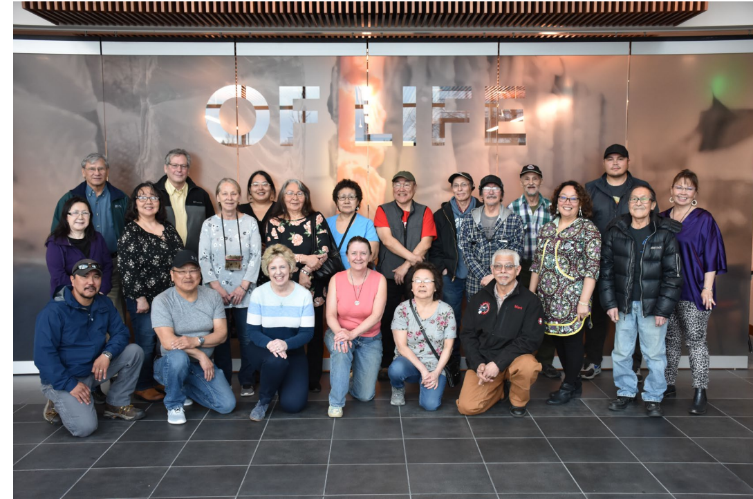
Native Entrepreneurial Empowerment Workshop Attendees