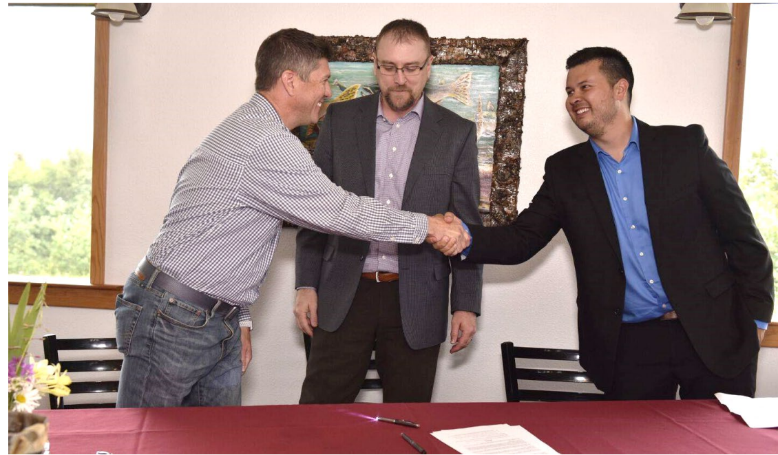
Choggiung Limited acquired 51% of Bristol Industries, LLC in 2018