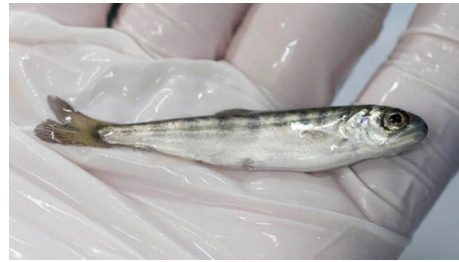
Chinook salmon fry.