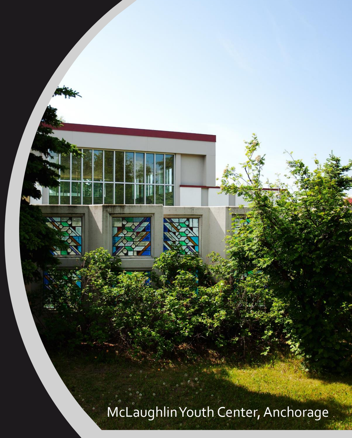
McLaughlin Youth Center, Anchorage

Senate Health and Social Services Committee