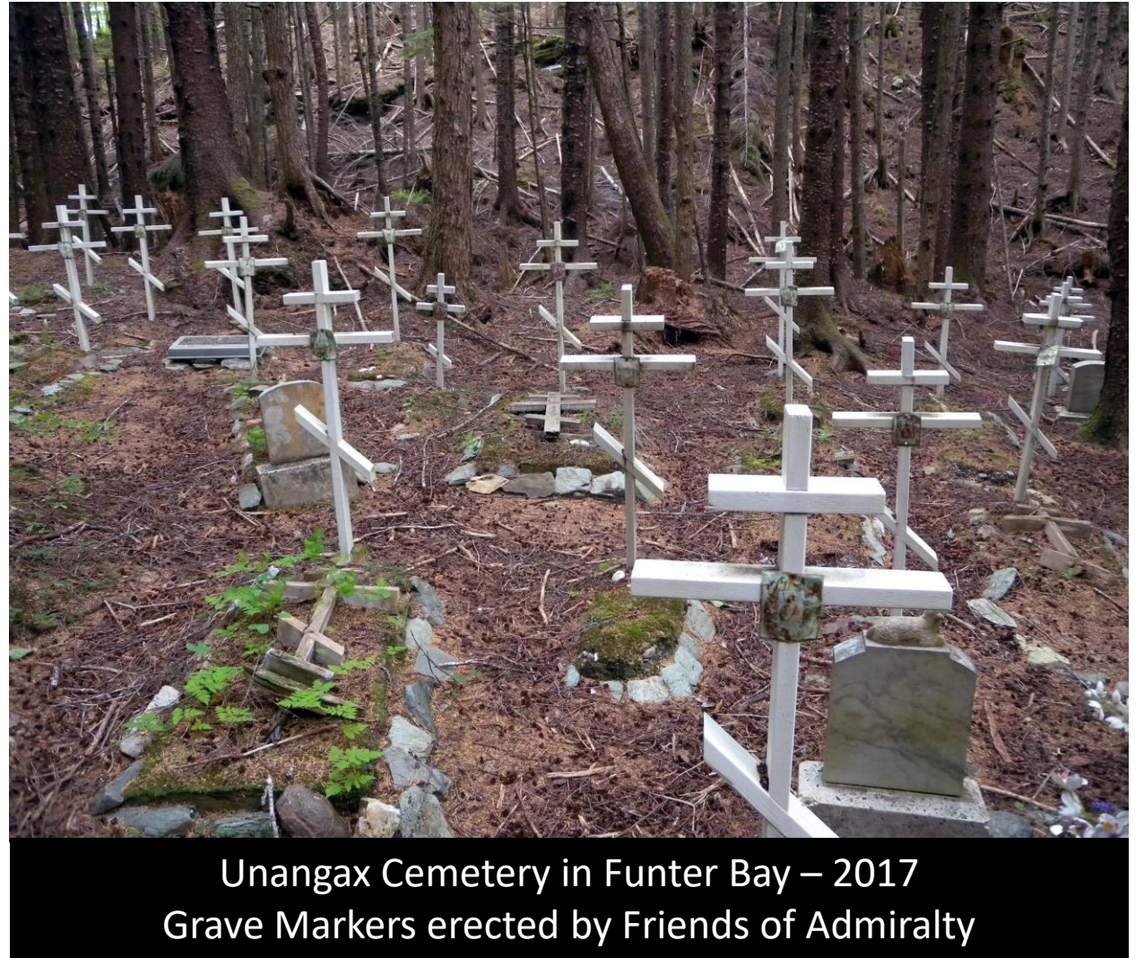
Unangax Cemetery in Funter Bay – 2017 Grave Markers erected by Friends of Admiralty