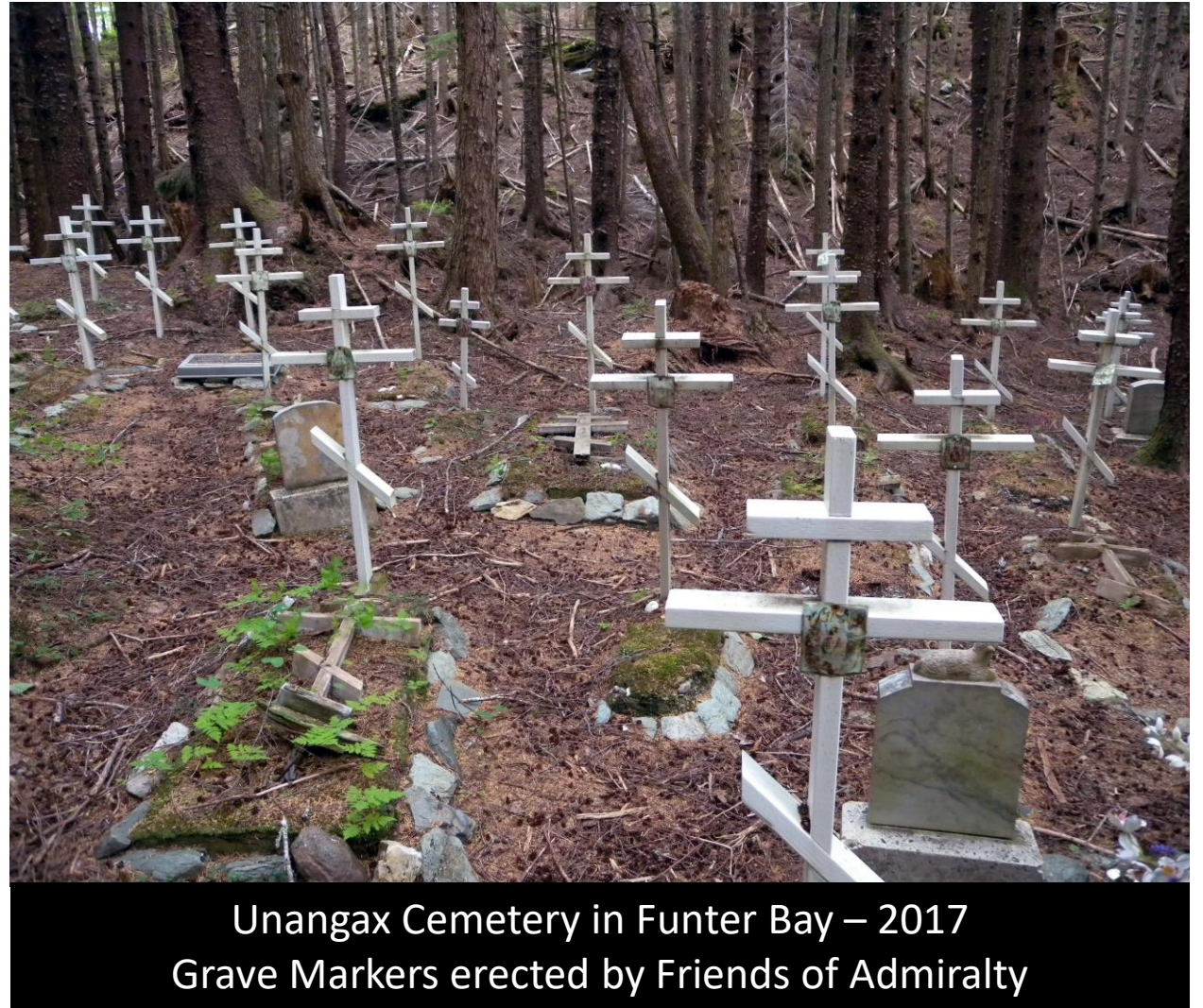
Unangax Cemetery in Funter Bay – 2017 Grave Markers erected by Friends of Admiralty