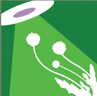
Alien Species Control, LLC