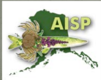
Alaska Invasive Species Partnership