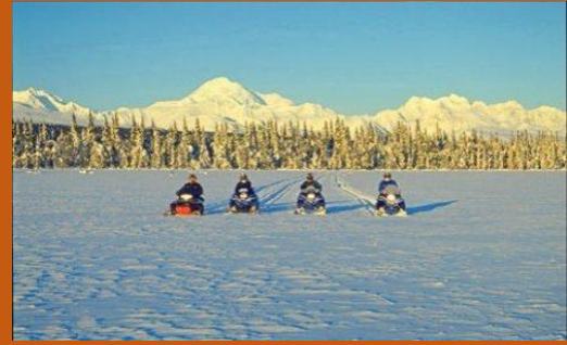
Just another nice ride with a Denali view, on the winter trail system north of Petersville Rd in the Mat Su Borough