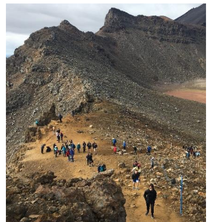
Above: 1000 people/day on the 20K Tongariro Nat'l Park Alpine Crossing