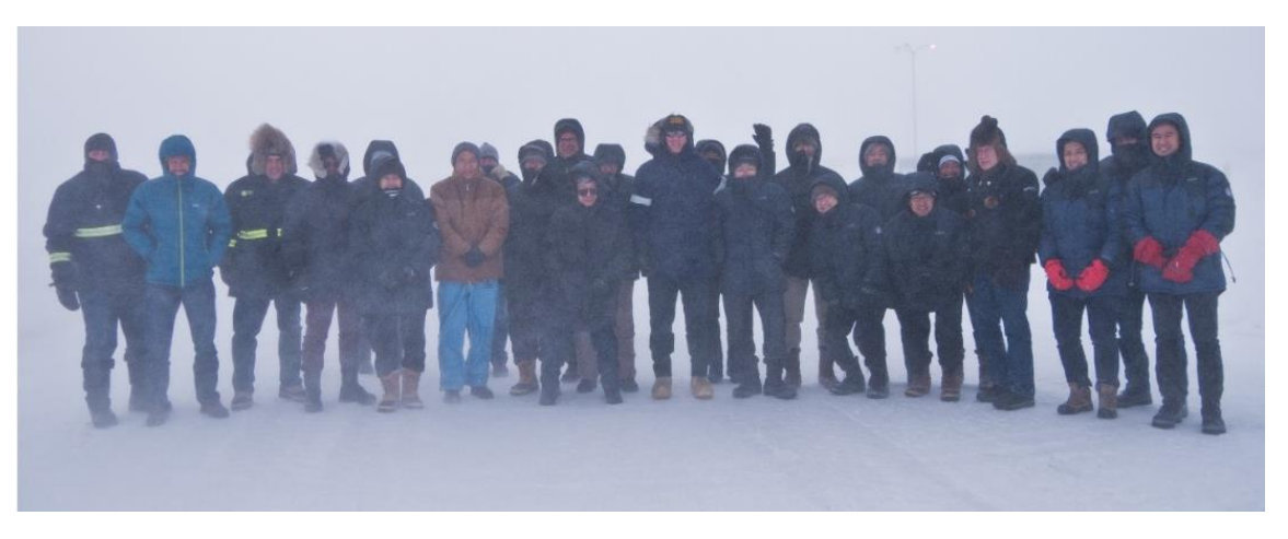
Summit delegates experience Prudhoe Bay