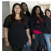
NPR ED Activists Stop Paying Their Student Loans