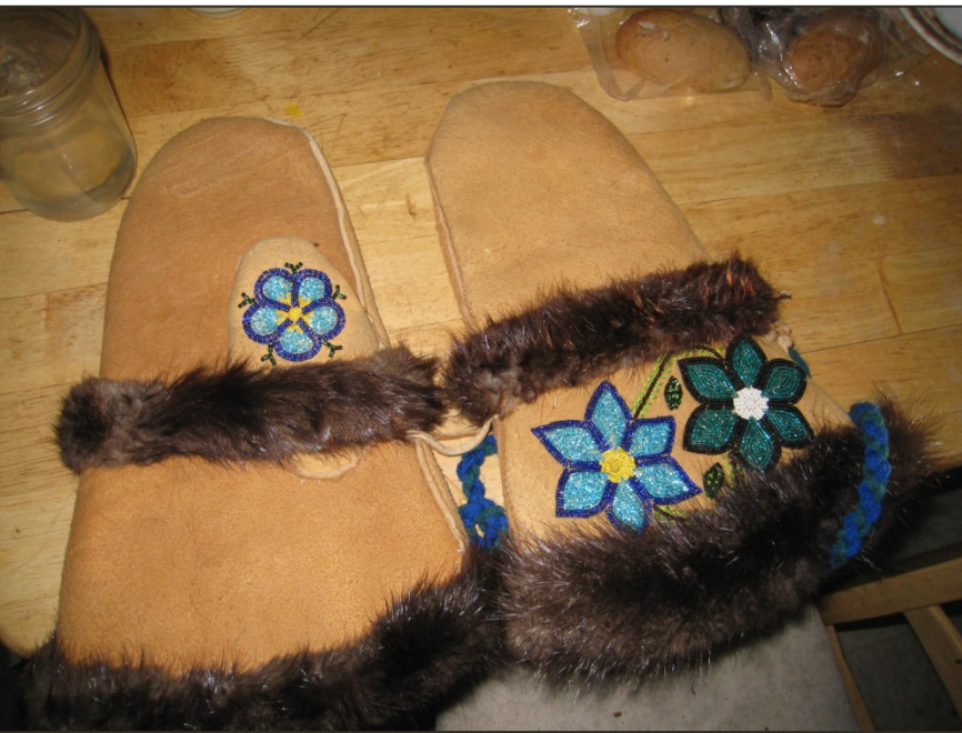
Mittens made in Beaver, 2011