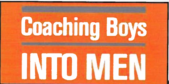
COACHING BOYS INTO MEN