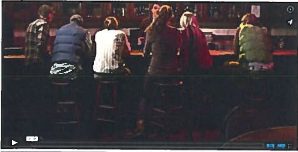
PUBLIC SERVICE MEDIA CAMPAIGNS