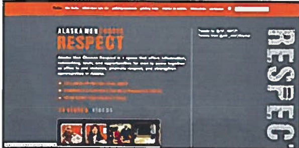
ALASKA MEN CHOOSE RESPECT