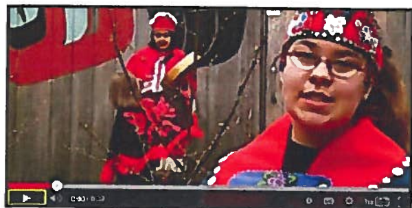
WHEN I AM AN ELDER

Mailing address: P.O. Box 111200, Juneau, AK 99811-1200 Phone: (907) 465-4356 Physical address: 450 Whittier Street, Room 105 Juneau, AK 99801-1200 Department of Public Safety Site Map Privacy Policy Contact Us State of Alaska © 2014 DPS Webmaster