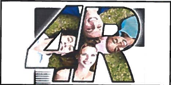
THE FOURTH R