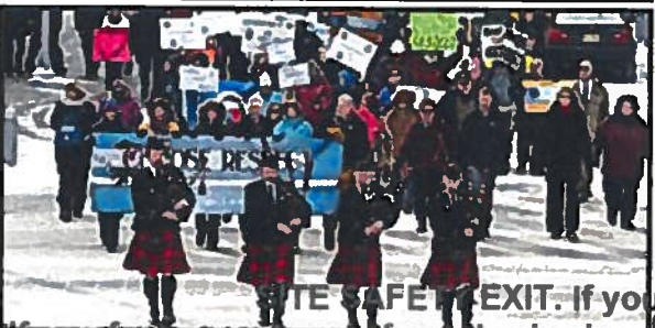
CHOOSE RESPECT CAMPAIGN

SAFE EXIT: If you are in immediate danger, call 911. If you feel you are unsafe while viewing information on this site, click anywhere on this bar to immediately exit.