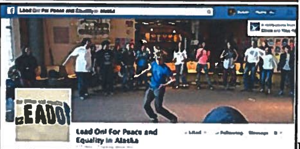
LEAD ON FOR PEACE AND EQUALITY