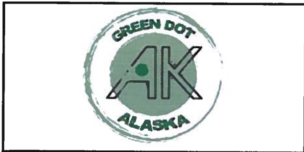
GREEN DOT ALASKA