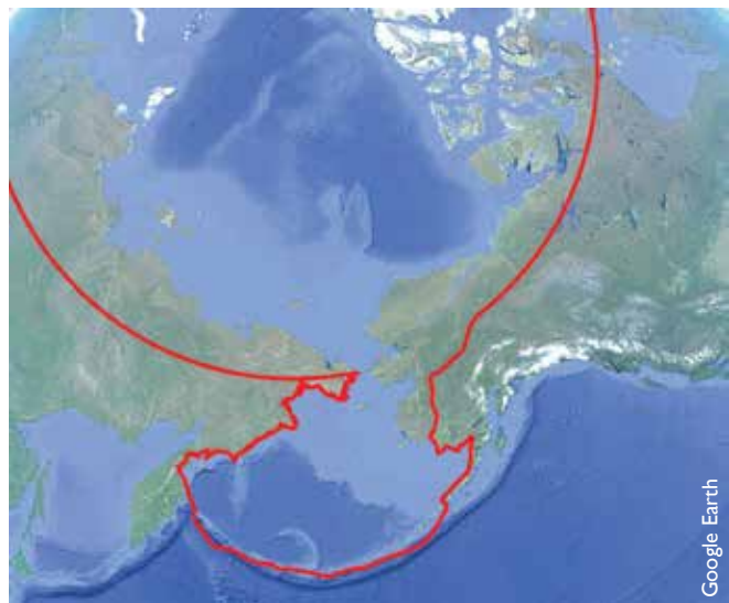
Arctic Boundary as defined by the Arctic Research and Policy Act (ARPA)