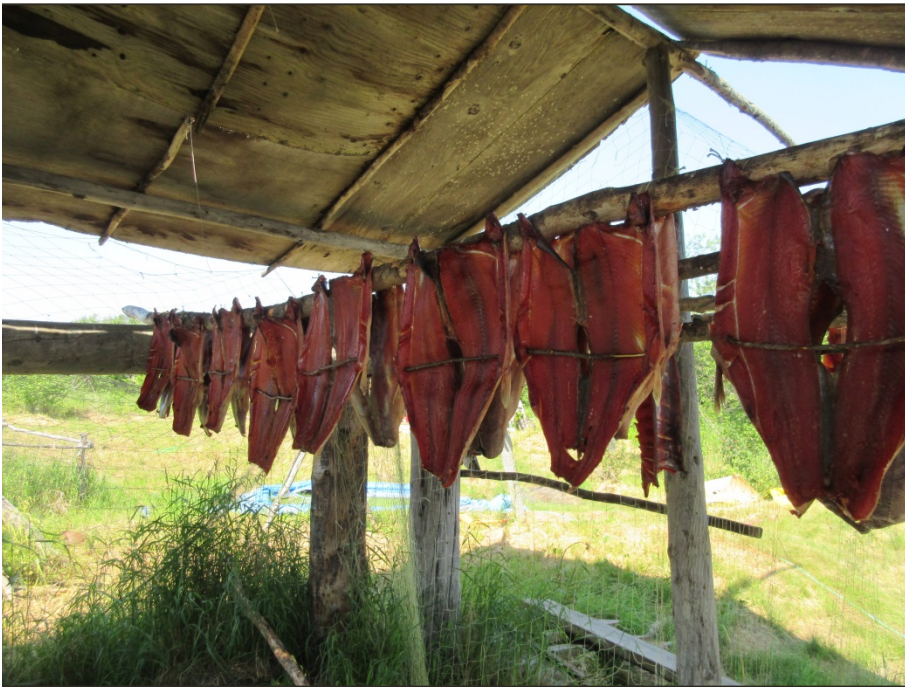
Kuskokwim River fish rack, 2015.