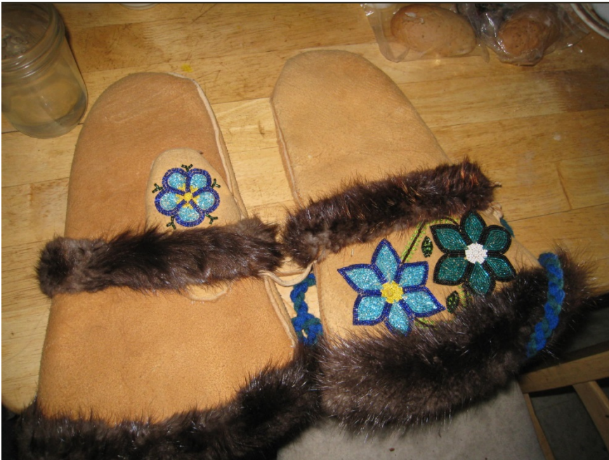
Mittens made in Beaver, 2011