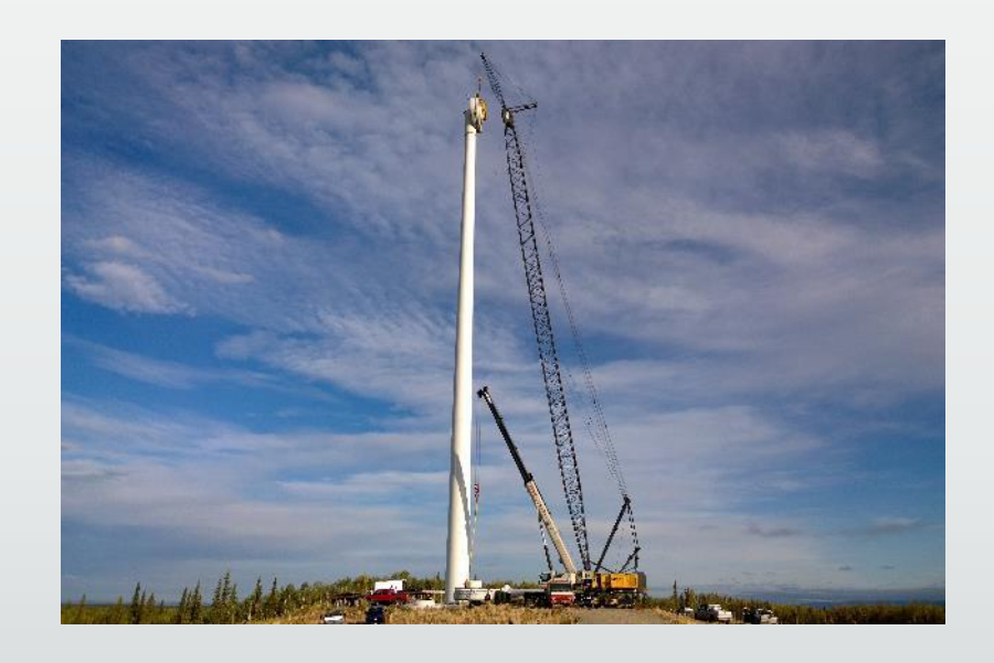
Delta Wind Project