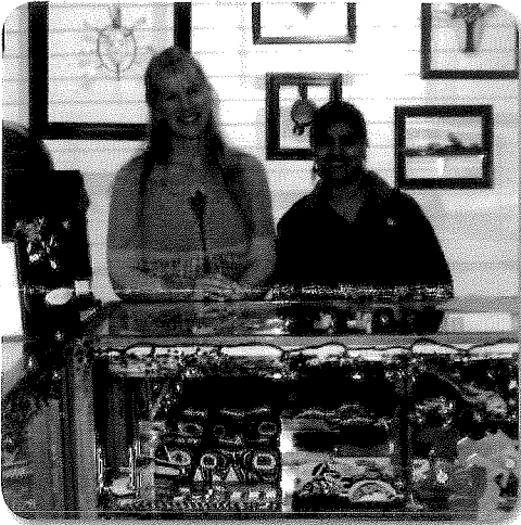
Sheldon Jackson Museum