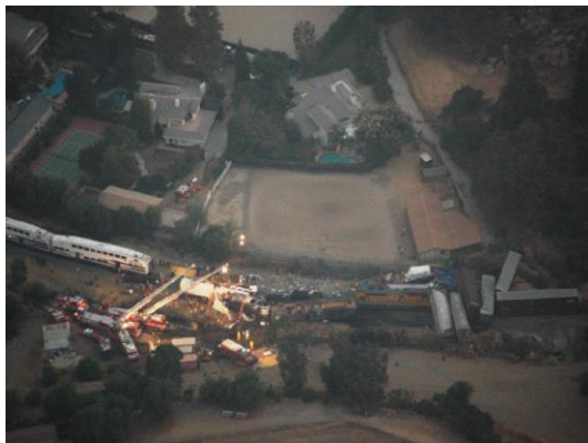
In 2008, a Metrolink passenger train in Los Angeles, CA passed a red signal while the engineer was texting, colliding head-on into a freight train resulting in 25 fatalities and 130+ injuries.

The NTSB has once again listed PTC as one of its top ten safety initiatives. The NTSB reinforced the 2015 deadline due to a number of serious train accidents.