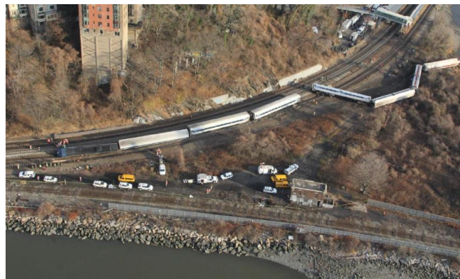
In 2013, a Metro North passenger train in Bronx, NY derailed when the engineer fell asleep going 82 MPH in a 30 MPH curve resulting in 4 fatalities and 63 injuries.