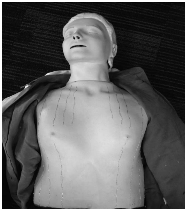
FIGURE 1. The manikin with wires stitched into the skin covering the right and left sides from the upper chest through the abdomen. The wires were attached inside the manikin to a rhythm simulator to provide the electrocardiographic (ECG) ventricular fibrillation (VF) signal. The wires allowed transmission of impedance and ECG signals to the electrode pads simulating a patient in VF.

To examine our assumption that AEDs differ in the quality of voice and graphical prompts, thus affecting usability, four different AEDs were studied: AED1 was the Philips HeartStart OnSite (Seattle, WA), AED2 was the Zoll AED Plus (Chelmsford, MA), AED3 was the Cardiac Science Powerheart (Irvine, CA), and AED4 was the Medtronic CRPlus (Minneapolis, MN). To make the simulation more realistic, clinical AEDs were used as opposed to AED trainers. The AEDs were