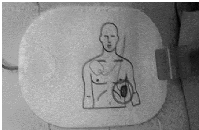
FIGURE 4. Icon for AED1 (one of the four automated external defibrillators studied) depicting the relative locations for both pads.

Resuscitating a victim of cardiac arrest involves much more than operation of an AED. Recognizing the cardiac arrest, calling EMS, and performing CPR as a bystander are all important steps; however, timely