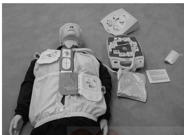
FIGURE 2. An example of electrode pads placed over the victim's clothes.

In contrast, AED1 and AED4 users were successful in delivering a shock in all valid trials. In the time it took users to deliver a shock, AED1 and AED4 were mathematically similar (Figure 5, Table 2). The median times were well under 2 minutes, at 99 and 93 seconds, respectively. The other two devices were significantly slower, with users of AED3 taking 132 seconds (just over 2.0 minutes), and users of AED2 taking 210 seconds (or 3.5 minutes). We also looked at time per AED task for each of the four AEDs, broken down into