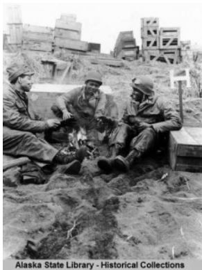
Soldiers at Massacre Bay, Attu, Alaska, May 16, 1943. ASL-P175-052.

hour; many Alaskans did the same. Most residents of southeastern Alaska, however, did not change their clocks. They thus, in effect, moved to Pacific Standard Time, which they had observed prior to World War II.(15)