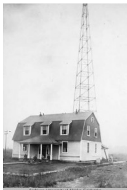
Telegraph station, Ft Gibbon, Tanana, Alaska, circa 1900.

Prior to 1900, towns in Alaska and the Yukon set their clocks to a local time based on longitude. Historical accounts from the gold rush period reveal a relaxed attitude toward time. Stampeders' diaries, for example, often note the hour at which their train arrived in Seattle, and many diarists were also careful to note the hour in which their steamship departed for Alaskan waters. But once the stampeders disembarked in the north country, time became less important. This attitude is reflected in the general omission of time references in the early Skagway and Dyea newspapers, even for store hours or steamship departure times, and most diarists paid little attention to time once they headed inland.