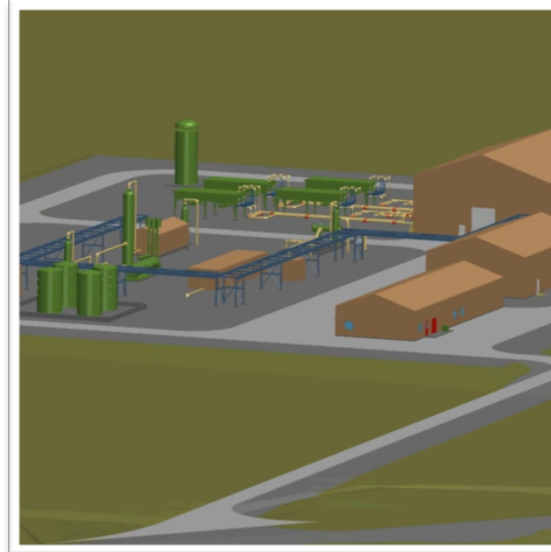
Cook Inlet Natural Gas Storage Alaska LLC