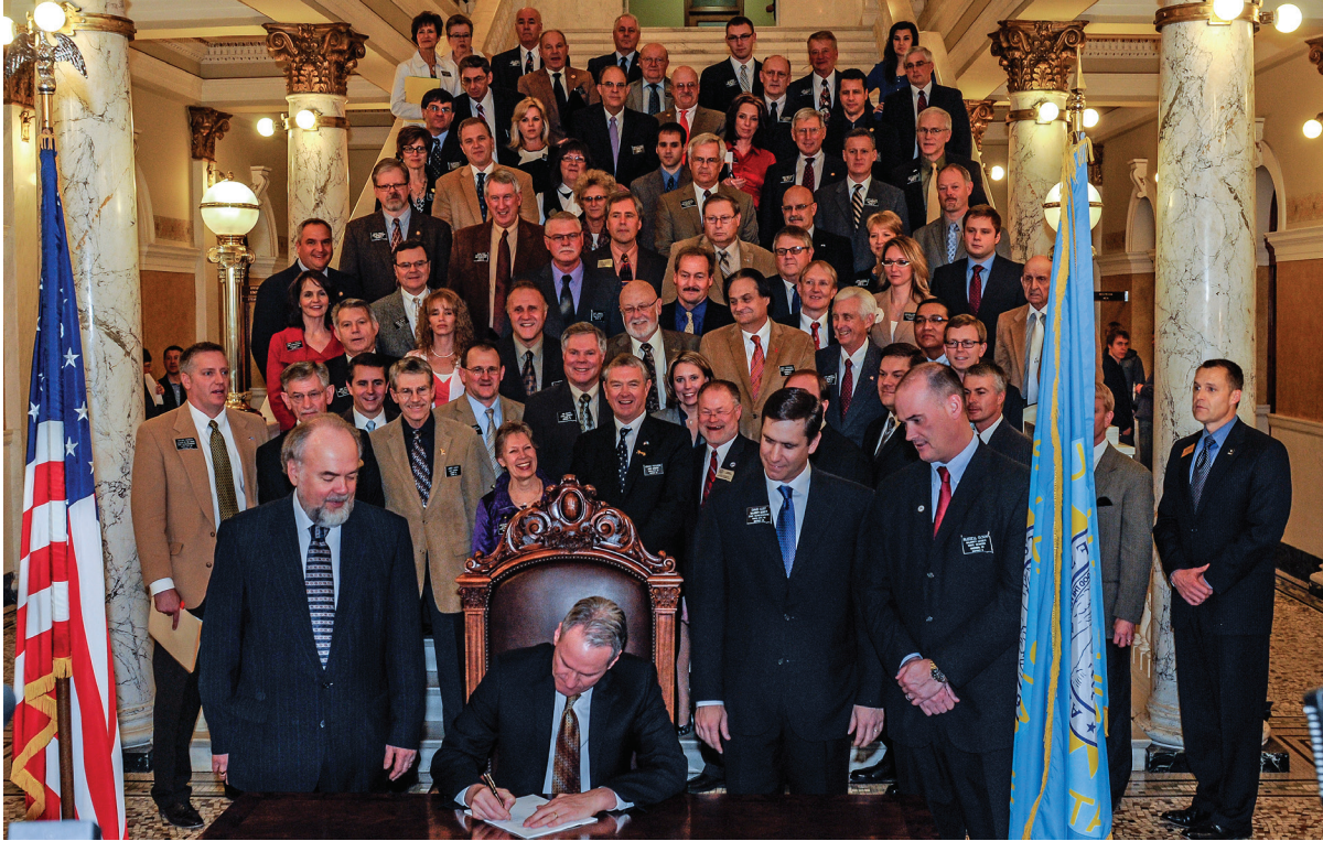
Gov. Dennis Daugaard signs the Public Safety Improvement Act into law Feb. 6, 2013.