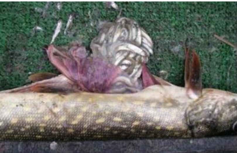
Pike from Deska River