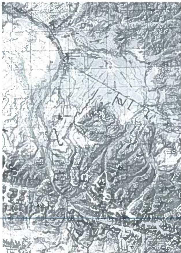
Above left —Red lines on the map indicate the inventoried trails.

Using GPS units, Colin and Will tracked the center-line of the trails, as well as collected geo-referenced photo points of resource concerns and general features of the trail. These include stream crossings, culverts, benches, signs, restrooms, scenic overlooks, camping areas and public use cabins.