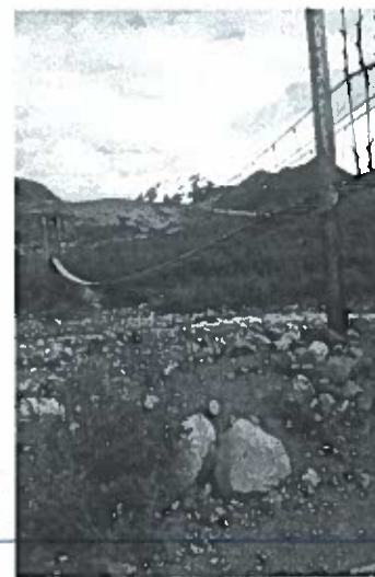
Above right —A suspension footbridge on the Gulkana Glacier Trail near Summit Lake.