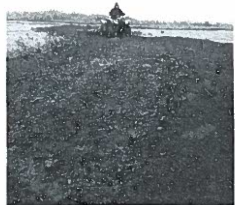
Above —A berm is lightly dragged by a SWCD employee on an ATV after grass was seeded and fertilized on the bison range.

Each range is unique in its location, forage species, and utilization by bison and other wildlife species.