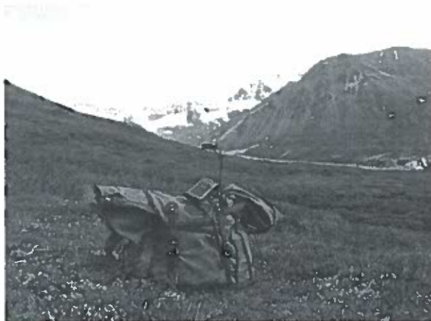
Above —GPS equipment used in the trail inventory above McCallum Creek in the Alaska Range.

The collected information will be useful to not only assist NRCS in identifying areas for possible future rehabilitation projects, but also to the District. The District plans to utilize the information to create a Delta Junction area trail guide available in both booklet form and KML format, which can be downloaded and viewed in Google Earth. This will significantly increase available outdoor recreational opportunities for local residents and visitors alike. @