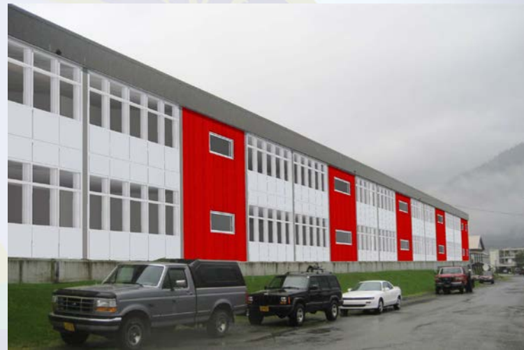
Proposed Front St. exterior