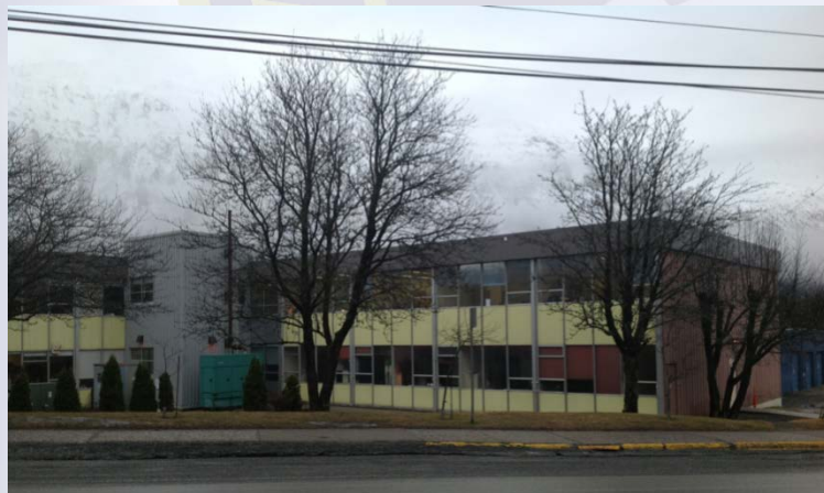
Existing Third St. exterior