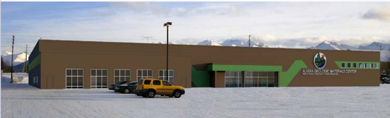
AGMC New Facility Renderings