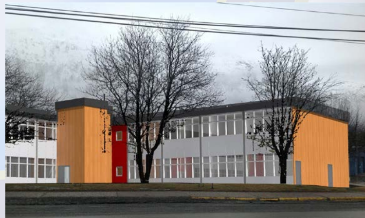
Proposed Third St. exterior