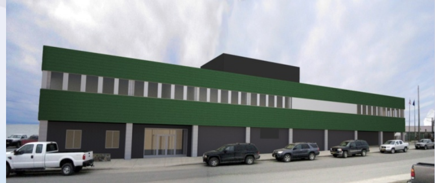
New green exterior