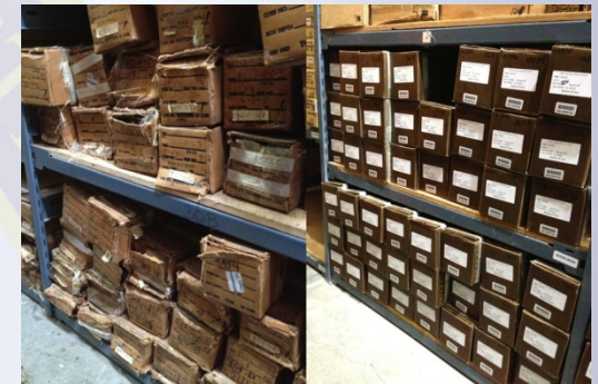
Change storage (above) to high density storage rack system (below)