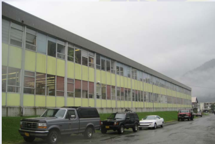
Existing Front St. exterior