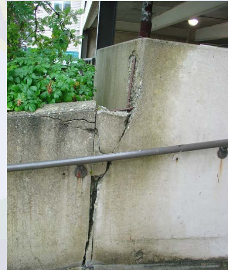
Concrete cracks and moisture penetration