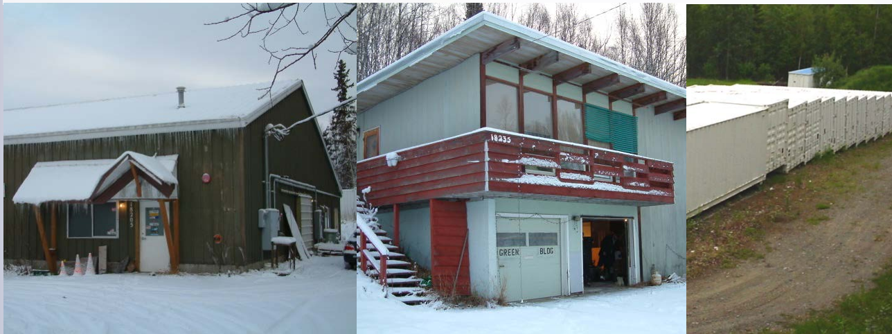
Current AGMC Facility