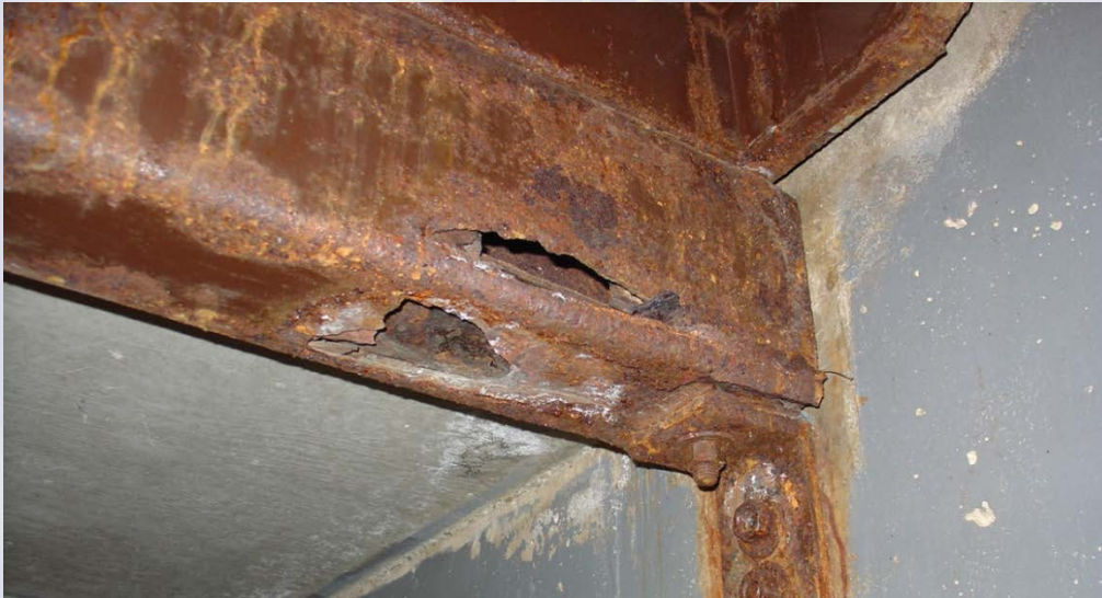
Corrosion on steel members