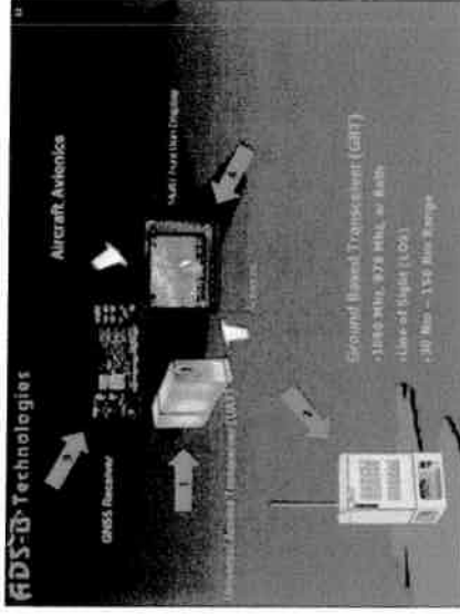
ADS-B Technologies, LLC

550 W. 7th Avenue Ste. 1650 Anchorage, Alaska 99501-3568 Telephone: (907) 269-8150 Fax: (907) 269-8147