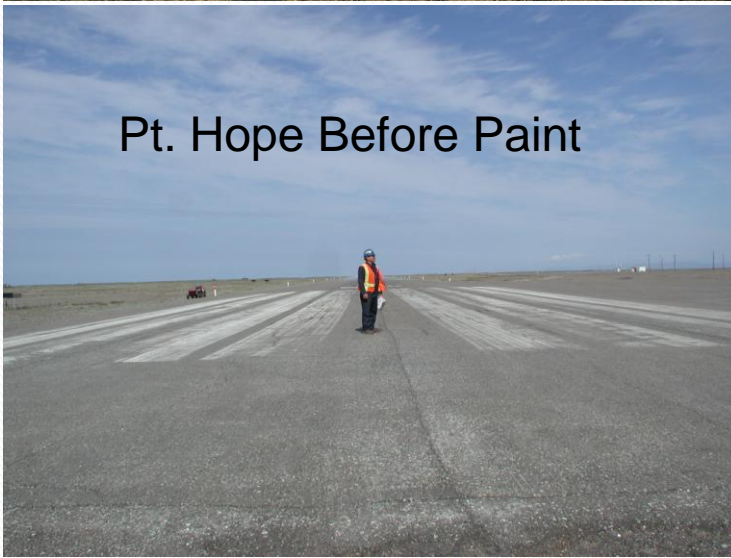
Pt. Hope Before Paint