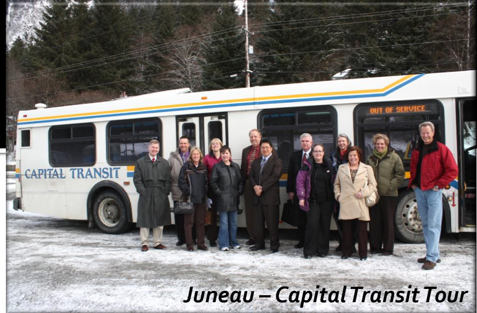
Juneau – Capital Transit Tour

Representative of municipal transportation departments