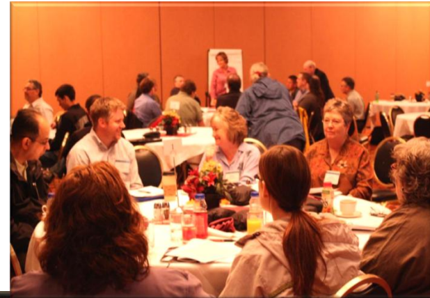
Alaskans participate in CTTF processes