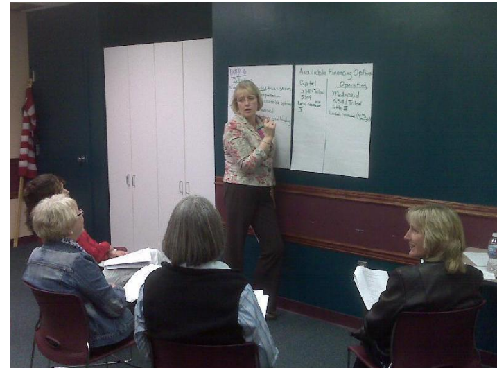
At work in Anchorage