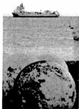
Alcatel installing a section of the new undersea fiber optic cable network at Kodiak Island, in 2006.

Construction of KLC began in 1998 and the facility was completed in 2001. AADC's customers to date have included the US Air Force, NASA, and the Missile Defense Agency.