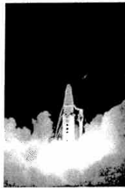
FTG-02 lifts off from KLC on September 1, 2006