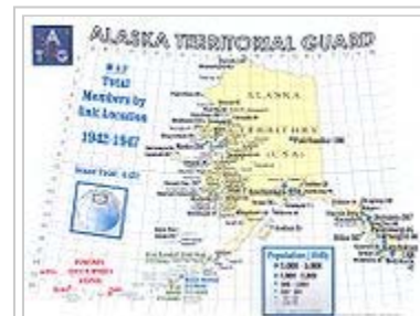
Map showing the locations of Alaska Territorial Guard units (with membership counts), major military bases, and evacuated Aleutian villages

The Alaska Territorial Guard (ATG) or Eskimo Scouts was a military reserve force component of the US Army, organized in 1942 in response to attacks on American soil in Hawaii and Alaska by Japan during World War II. The ATG operated until 1947. 6,368 volunteers who served without pay were enrolled from 107 communities throughout Alaska in addition to a paid staff of 21, according to an official roster [1] . The ATG brought together for the first time into a joint effort members of these ethnic groups: Aleut, Athabaskan, European American, Inupiaq, Haida, Tlingit, Tsimshian, Yupik, and most likely others. In later years, all members of some native units scored expert sharpshooter rankings [2] . Among the 27 or more women members were at least one whose riflery skills exceeded the men [3] . The ages of members at enrollment ranged from 80 years old [4] to as young as twelve [5] (both extremes occurring mostly in sparsely populated areas).