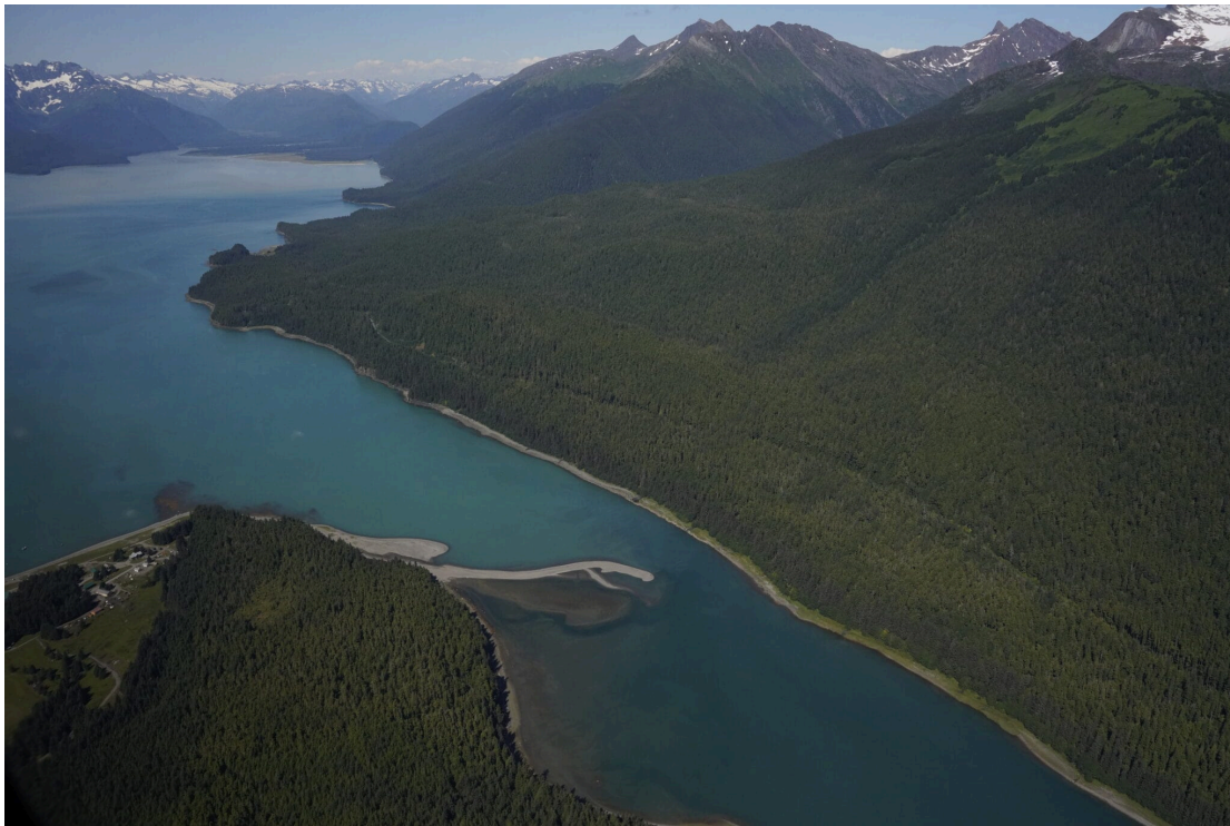
An aerial view of Berners Bay, where the state is proposing to build the Cascade Point Ferry Terminal.

Share: Facebook Twitter Email Print RSS LinkedIn StumbleUpon Reddit Tumblr Pinterest VK WhatsApp Telegram Messenger Signal SMS Print Copy Link Copy Paste Close