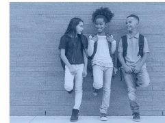
Concurrent Juvenile Jurisdiction