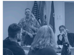
Military Community Representation on State Defense Councils