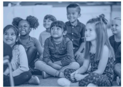
State Support of Military Families with Special Education Needs