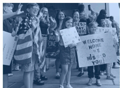
Military Clause in State Family Leave Laws