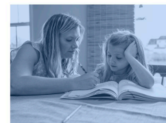
Solutions for Military Homeschoolers