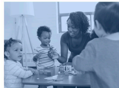
State Exemption for DOW Family Child Care Homes