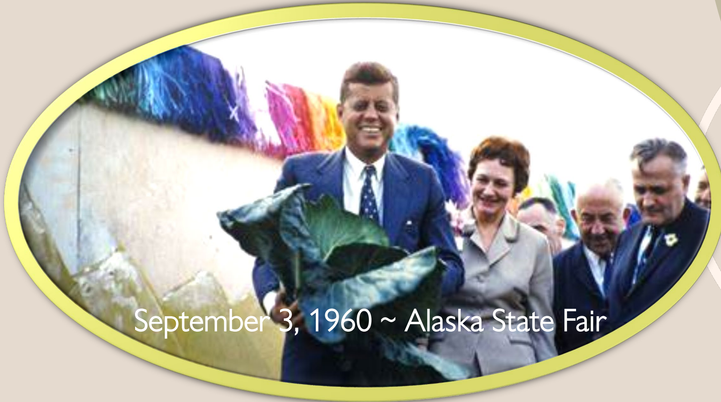
September 3, 1960 ~ Alaska State Fair

Giant Green Cabbages have a long- established place in Alaska's history