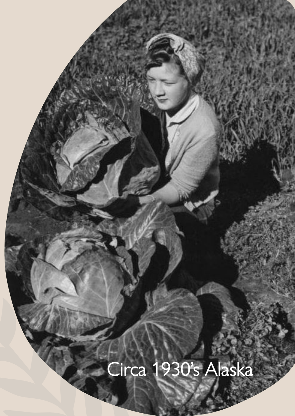
Circa 1930's Alaska

An Act Designating the Giant Cabbage as the Official State Vegetable.