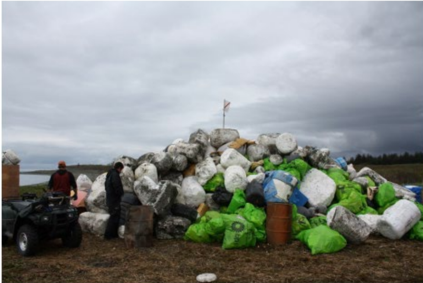
A Mountain of Plastic Trash Collected at Cape Suckling in 2013

A Review of Marine Debris Surveys, Accumulations and Cleanup Projects in Alaska through 2014