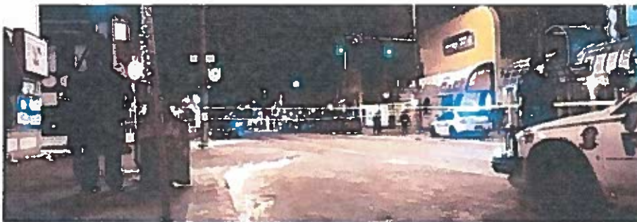
Anchorage police respond to 2018's first local homicide in the area of 4th Avenue and D Street in the early hours of Jan. 1, 2018.