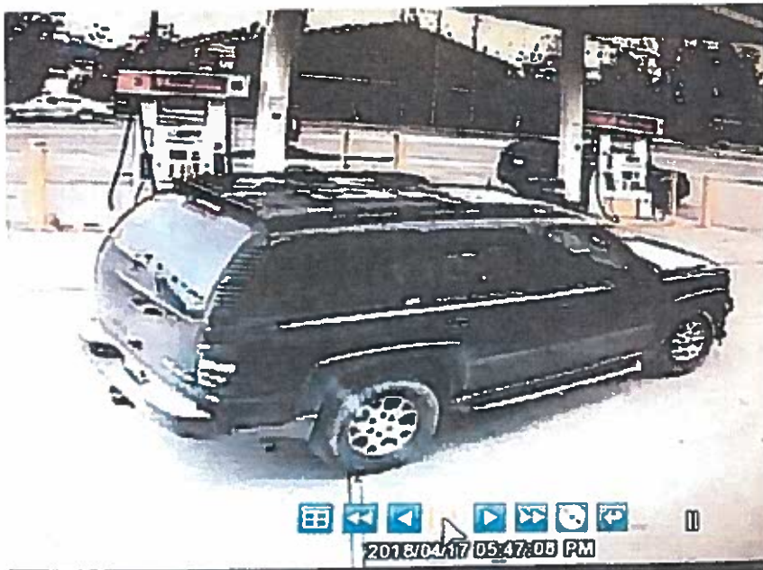
Image of the vehicle used in a robbery at the Shell gas station on 810 W. Tudor Road on Tuesday, April 17, 2018.

✍ Author: Laurel Andrews ⌚ Updated: 2 hours ago 📅 Published 3 hours ago