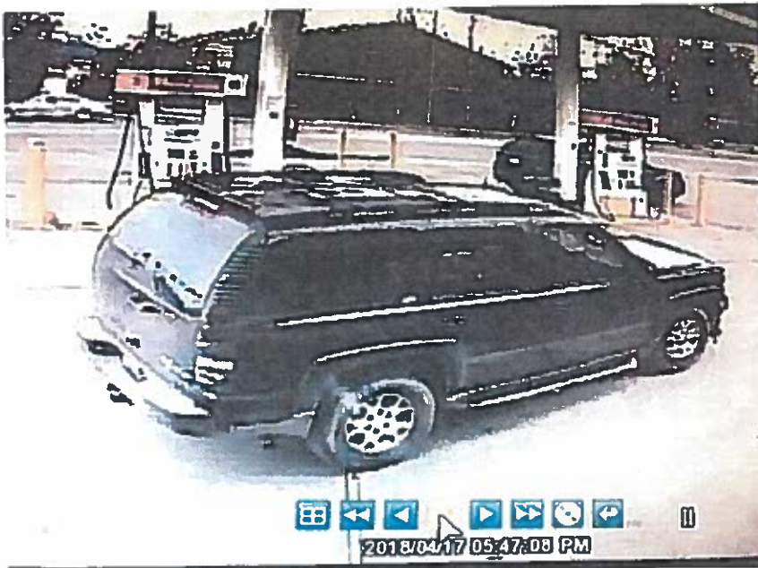
Image of the vehicle used in a robbery at the Shell gas station on 810 W. Tudor Road on Tuesday, April 17, 2018.

✍ Author: Laurel Andrews ⌚ Updated: 2 hours ago 📅 Published 3 hours ago