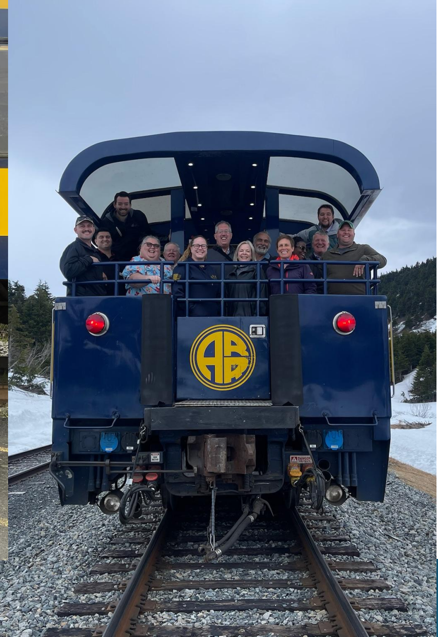
First Class Aurora Car - AKRR