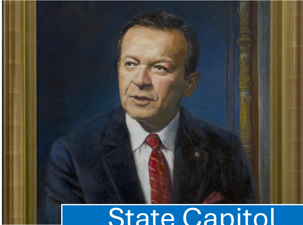
State Capitol Portrait