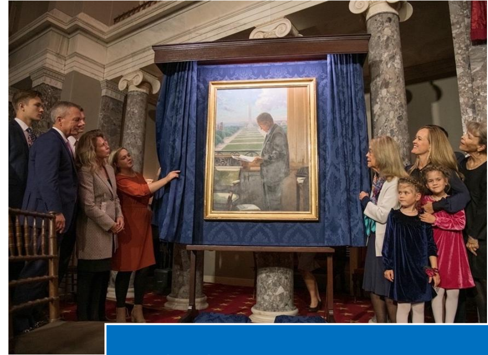
US Capitol Portrait