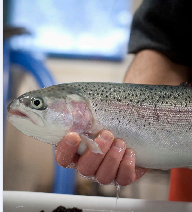
ADF&G Division of Sport Fish William Jack Hernandez Hatchery