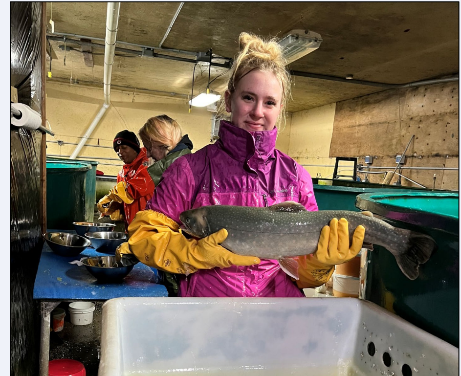
Icy Waters Arctic Charr Fish Farm in Whitehorse.

Economic Growth : introduces a new industry to Alaska, creating jobs and diversifying our economy.