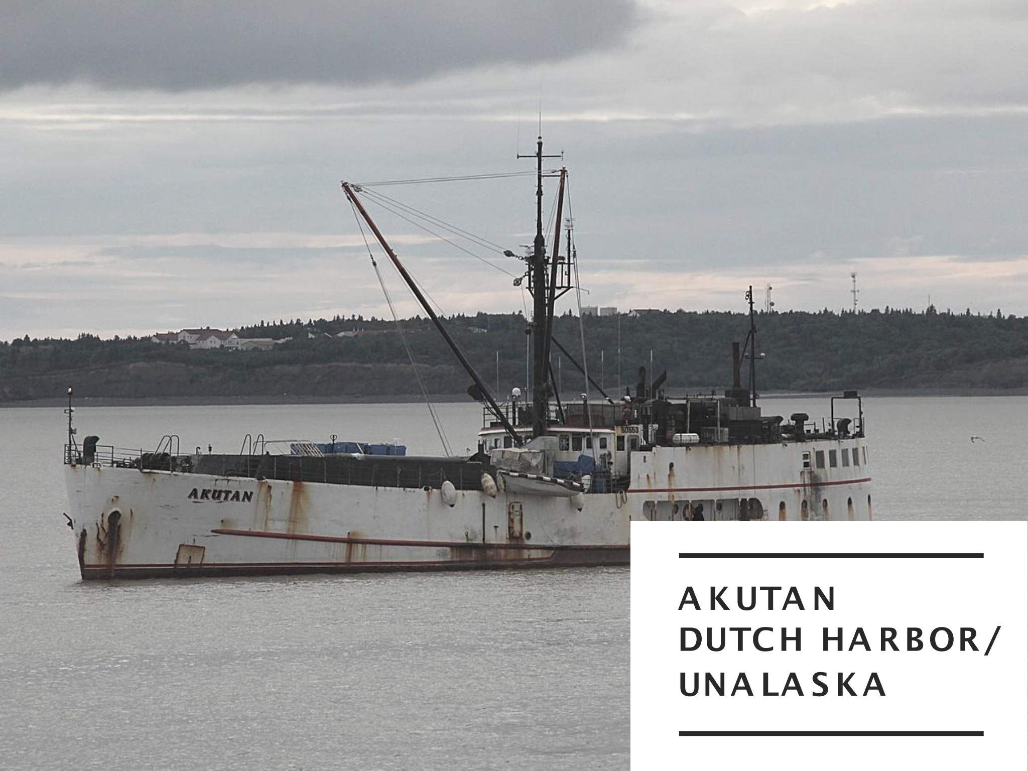
AKUTAN DUTCH HARBOR/ UNALASKA