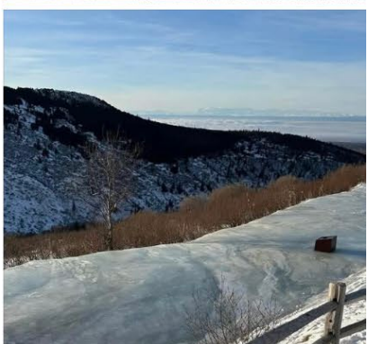
From the Office of Senator Cathy Giessel