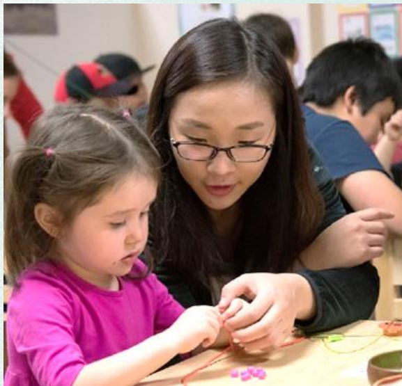
RTI Approach Related Technical Instruction