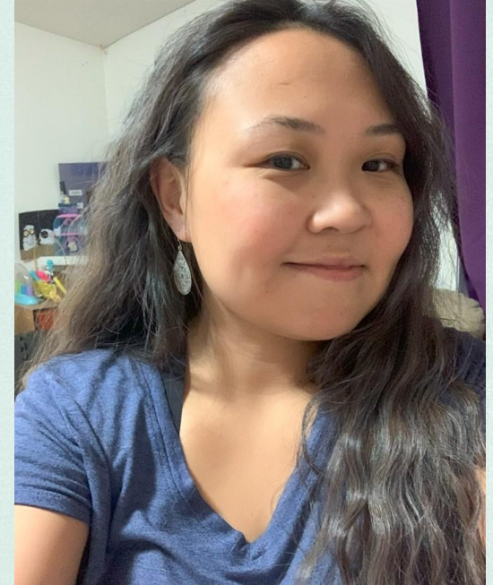
Olive Hill North Slope Borough School District