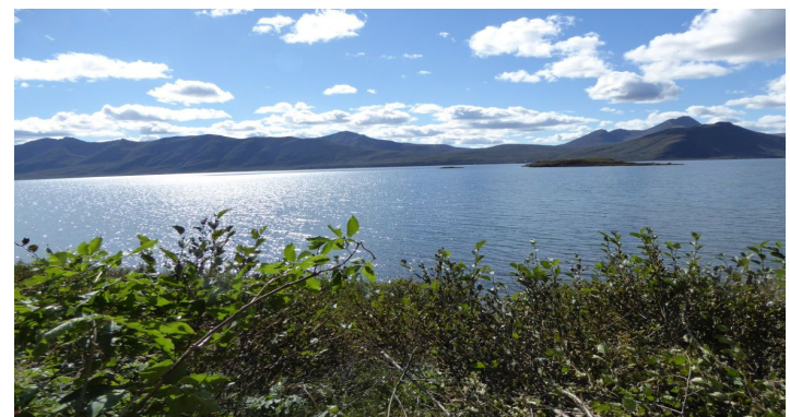
Snake Lake: 25,395 Acres 50 Staking Authorizations