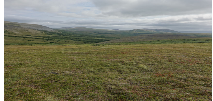
East Fork Pass: 16,350 Acres 60 Staking Authorization