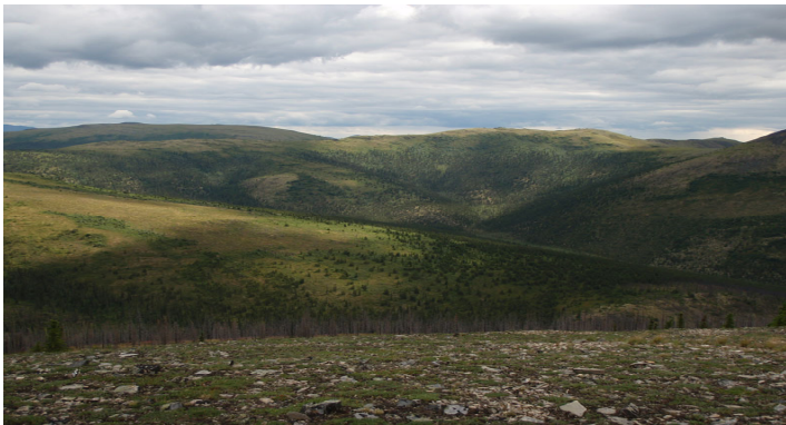
Mount Ryan II: 35,700 Acres 30 Staking Authorizations