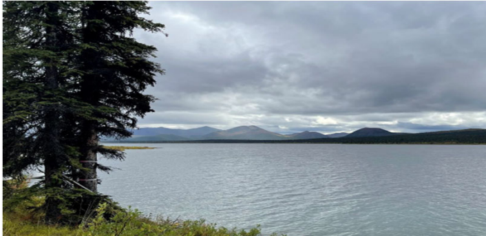
Mankomen Lake: 8,030 Acres 25 Staking Authorizations