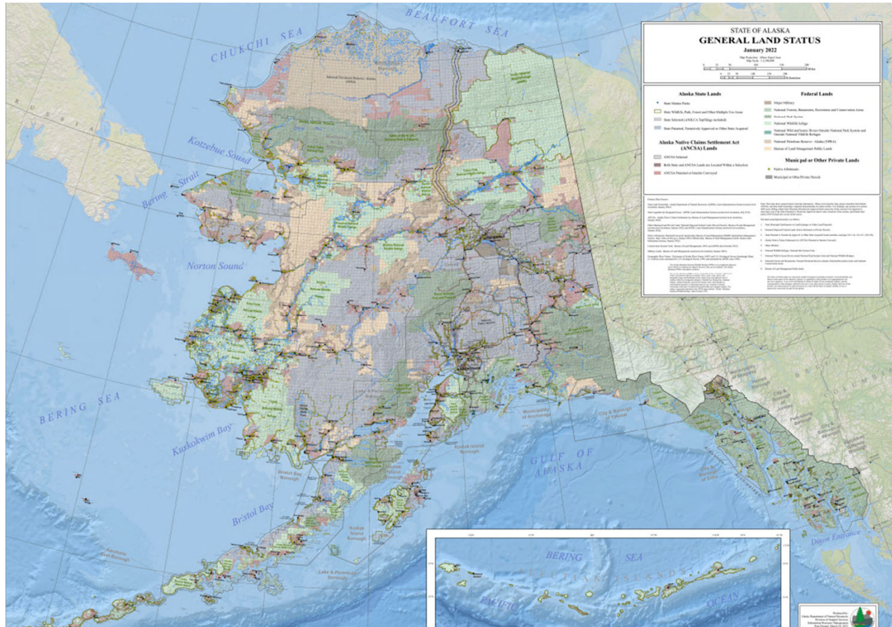
Alaska Department of Natural Resources