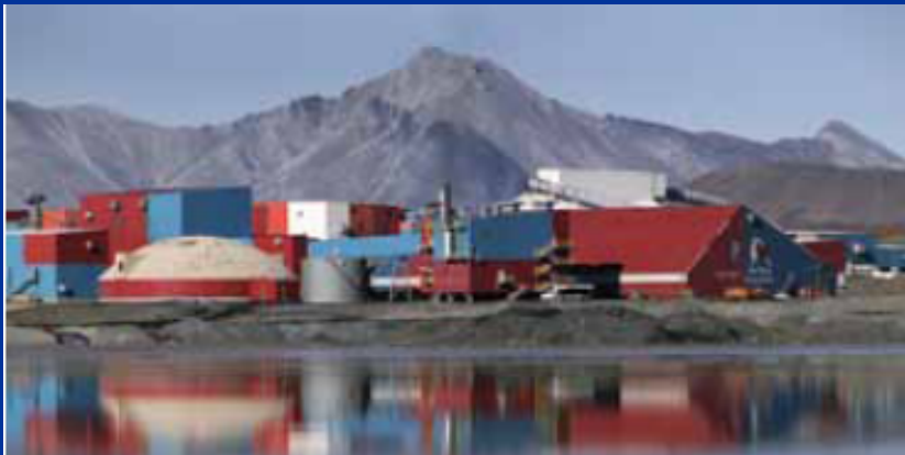
Teck Cominco/Red Dog Mine