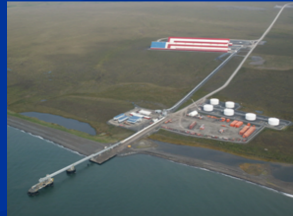
Teck Cominco/Red Dog Mine