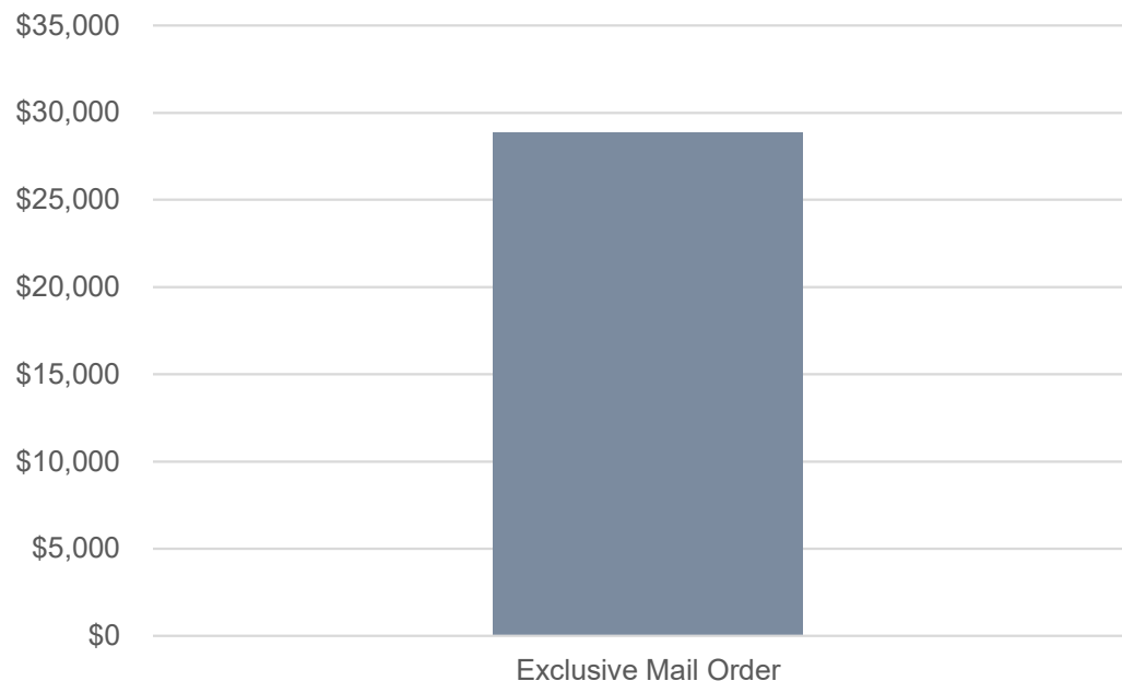
Mail Order Pharmacy Contract Loss