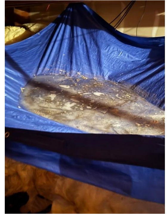
McGrath School Attic, Ice in Tarps - Iditarod School District