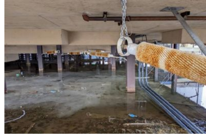
Standing water under Chevak School - Kashunamiut School District - Project #24