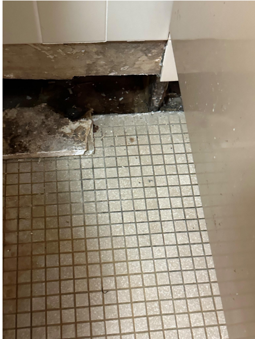
Bathroom Floor in Nikolai School - Iditarod School District