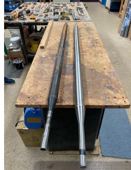
St. Paul School Air Handler Shaft, Pribilof School District - Project #6