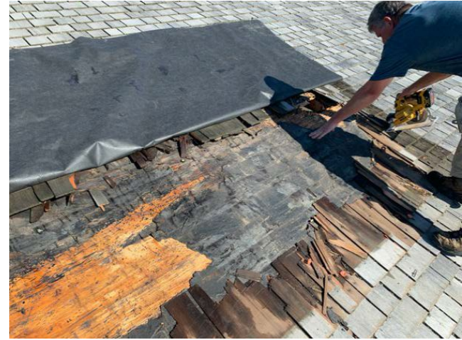
Homer High School Roof Dry Rot - Kenai Peninsula School District