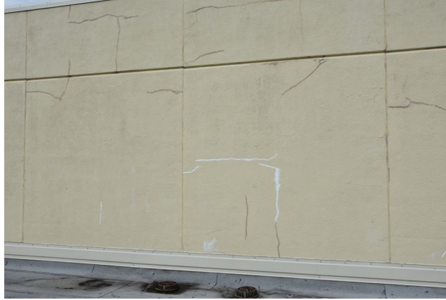
Soldotna High School Siding - Kenai School District - Project #4