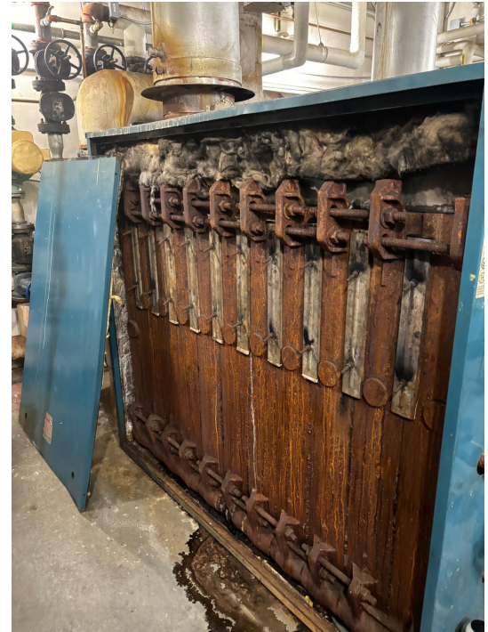
Kenny Lake Boilers - Copper River School District