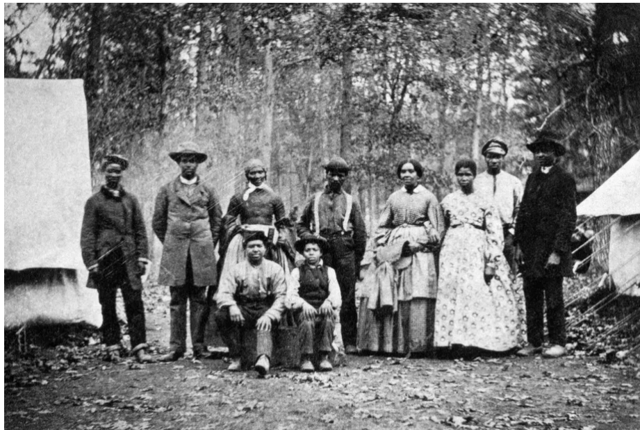
A group of formerly enslaved people who worked as laborers and servants with the 13th Massachusetts Infantry Regiment during the American Civil War, circa 1862.

Not to mention, the ratification happened after the Civil War had already ended — in April 1865, Confederate Gen. Robert E. Lee surrendered at Appomattox, Virginia. Enslaved people in Texas, meanwhile, didn't learn about their freedom until three months later. On June 19, 1865, Maj. Gen. Gordon Granger of the Union army arrived in Galveston and issued General Order No. 3 that secured the Union army's authority over Texas. The order stated the following: