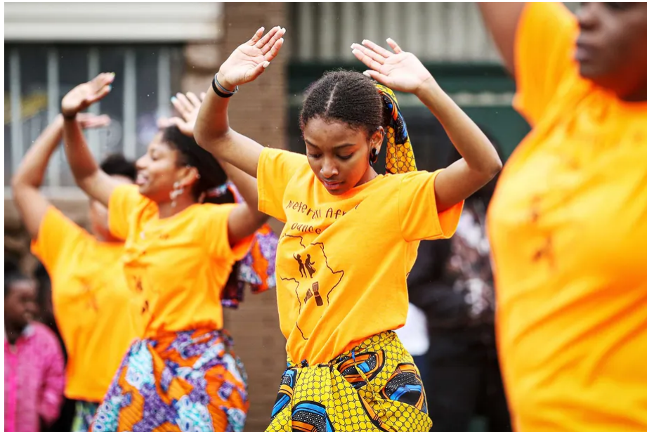
Performers during the 48th Annual Juneteenth Day Festival in Milwaukee, Wisconsin, on June 19, 2019.