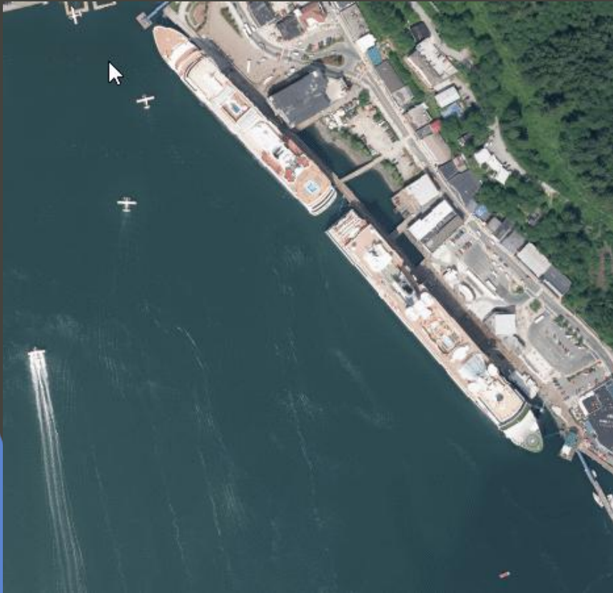
Port of Juneau – Pre-2016