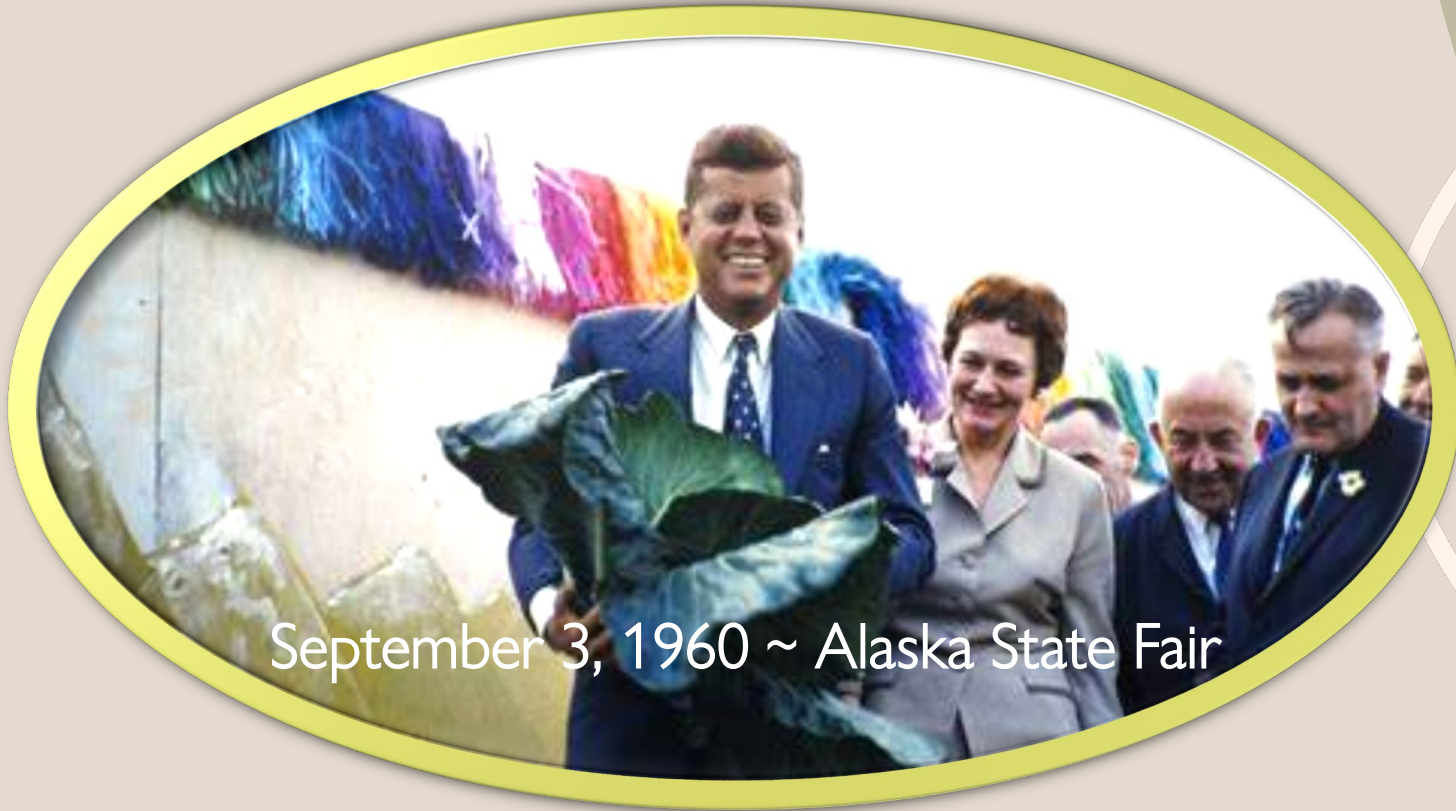
September 3, 1960 ~ Alaska State Fair

Giant Green Cabbages have a long- established place in Alaska's history